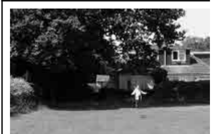
How will this tranquil recreation ground help prevent flooding on our roads in winter? See Digging in to beat floods on Page 2.

Here too, the credit belongs to local people willing to take action and get politicians to listen to and act on their concerns.